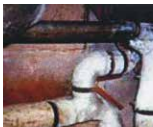
Asbestos pipe lagging