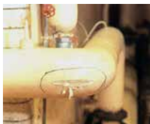
Asbestos pipe lagging