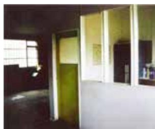
Asbestos insulating boards