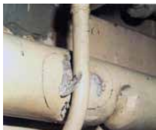
Asbestos pipe lagging