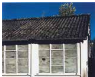
Asbestos cement roof