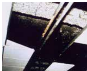
Asbestos sprayed steel beams