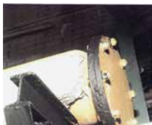
Asbestos pipe lagging