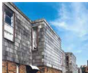
Asbestos cement tiles