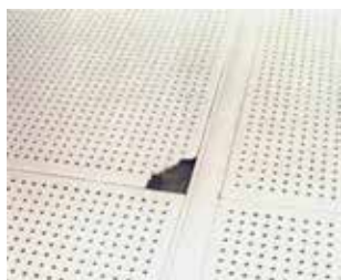
Asbestos ceiling tiles