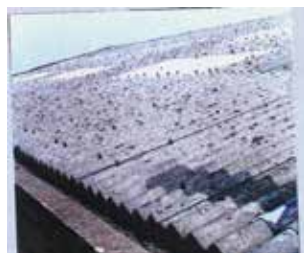
Asbestos corrugated roof