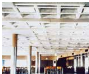
Asbestos spray on ceiling