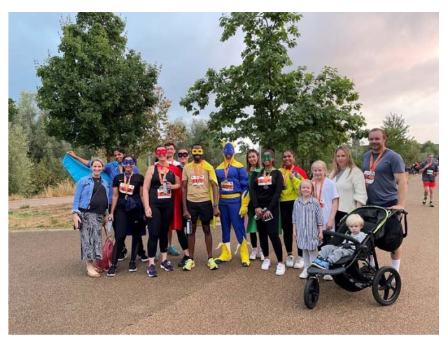
Joint Conference | Asbestos Support Central England, Derbysire Asbestos Support Team and Yorkshire and Humberside Asbestos Support