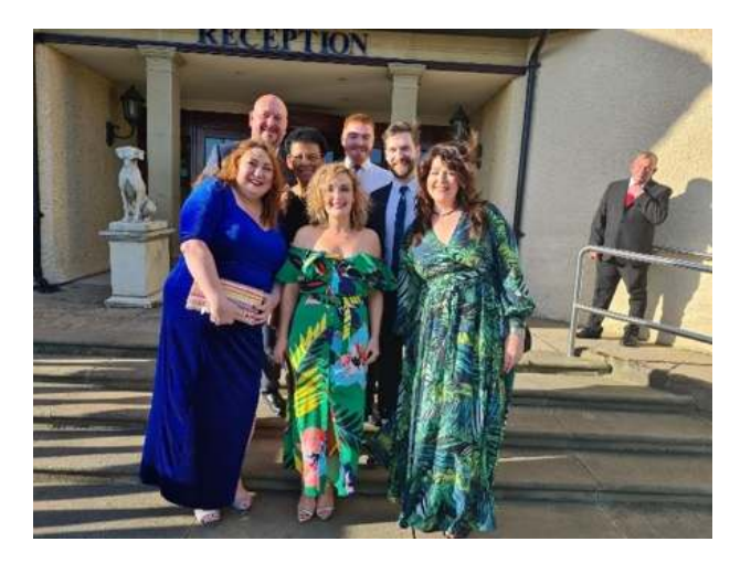
Action Meso Day | Greater Manchester Asbestos Victims Support Group

Bright Colours Ball | Bright Colours ball in support of Mesothelioma UK and Readley.